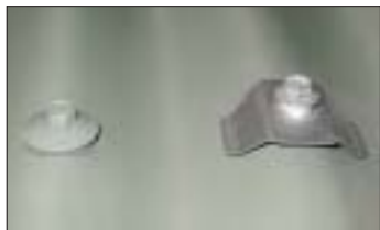
Storm-Tite® means better aesthetic roof appearance

Deks Sealing Washer guaranteed for 20 years